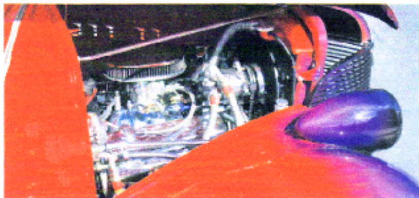
This 1939 Chevy Master Deluxe's small block has been massaged to produce a whopping 370 hp.

With the exception of classic turn-signal head boxes, Shue has changed very little since he purchased it. However, owning the car