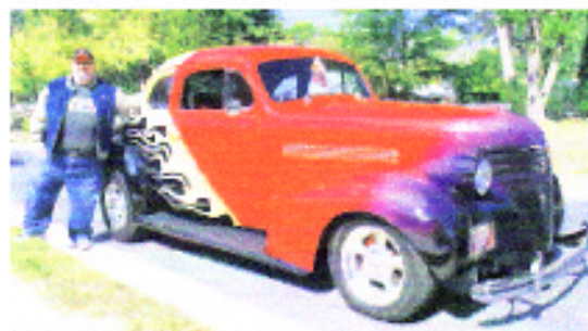
Tim Shue bought the flame-painted hot rod in 2005.

And your first ride? What was it for? Speeding my mother's car.